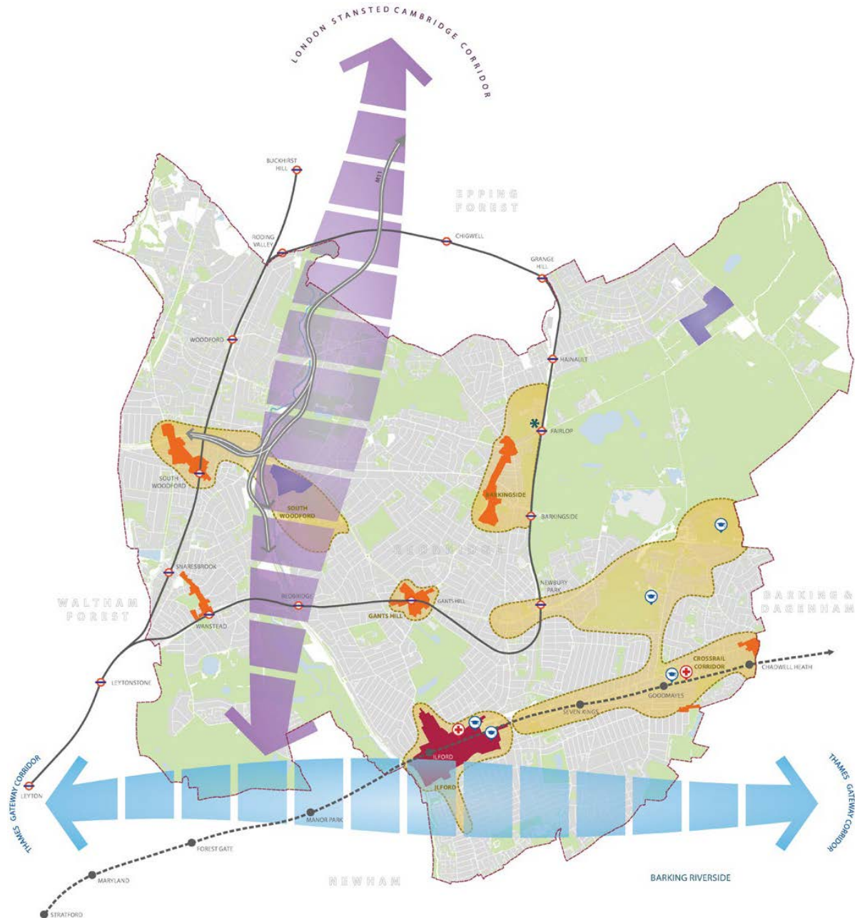
Figure 1: Local Plan Key Diagram

3.6 Redbridge’s housing target is imposed on the Council by the Greater London Authority via the London Plan. It follows the national position set out in the National Planning Policy Framework. Whilst various policy changes (regional and national) vary the targets, Redbridge’s housing target (for the 2017-2020 period) was to deliver 1,123 new homes per year. With the adoption of the new London Plan, the target is now 1,409 a year.