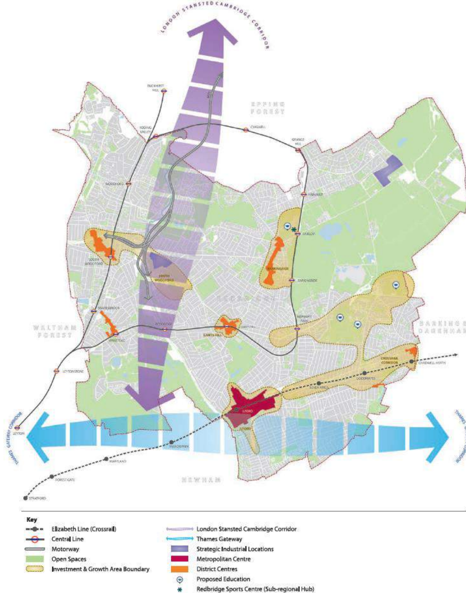
Figure 2.1: The Pre-submission Plan Key Diagram