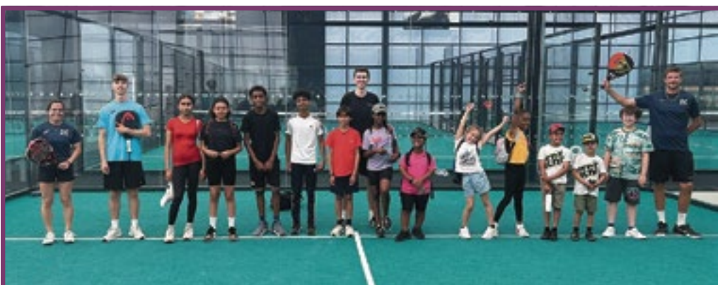
The summer HAF programme provides sports activities and educational workshops

Delivered by Redbridge Council, the programme provides free food and character-building experiences aimed at keeping children active and learning outside of school. HAF collaborates with partners, such as Empower Youth, Learning Hive, Kids In Charge, and Redbridge Youth Services, to deliver a variety of activities, including sports, creative arts, educational workshops, and nutritional education.