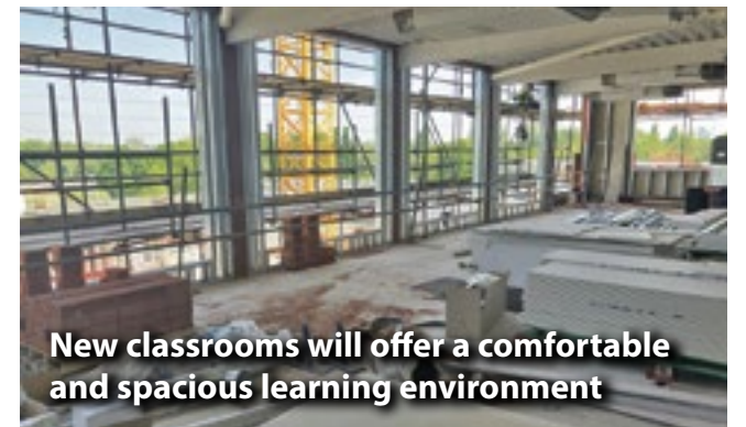
New classrooms will offer a comfortable and spacious learning environment

Further information on memberships will be available later this year. We look forward to sharing more exciting news with you soon. Please visit https://engage.redbridge.gov.uk/wlc