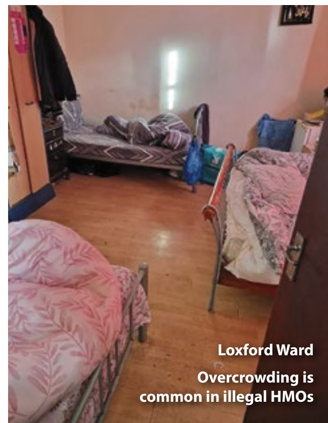
Loxford Ward Overcrowding is common in illegal HMOs

Under the Council's two Selective Licensing schemes, it is estimated there are over 36,000 properties that require a property license.