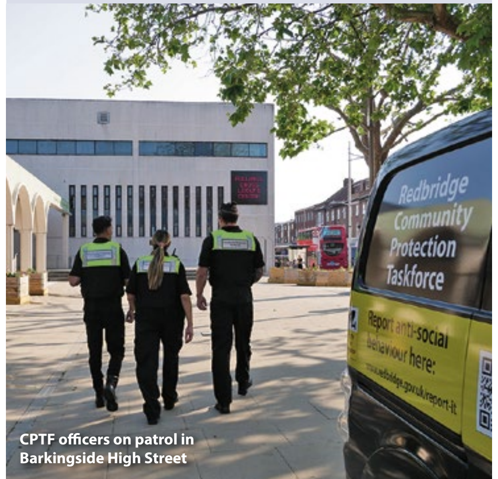
CPTF officers on patrol in Barking High Street

We're working with the police to enforce our PSPOs so residents and visitors can feel safe. You can help us by calling 101 to report anti-social behaviour.