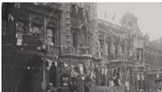
VE Day celebrations at Ilford Town Hall, 8 May 1945

On Thursday 8 May 2025, the country marked the 80th anniversary of Victory in Europe Day (VE Day). Many of our residents hosted street parties over the May Bank Holiday weekend but how was the first VE Day celebrated in Redbridge?