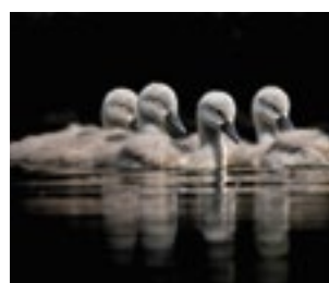
Redbridge Nature category: Callum Church