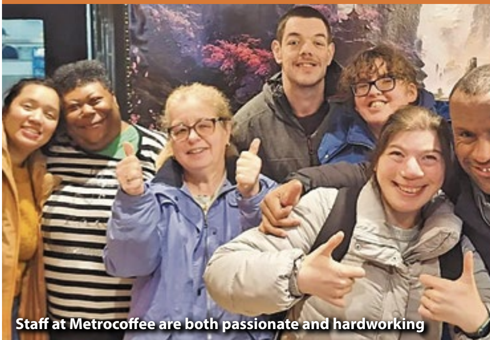
Staff at Metrocoffee are both passionate and hardworking