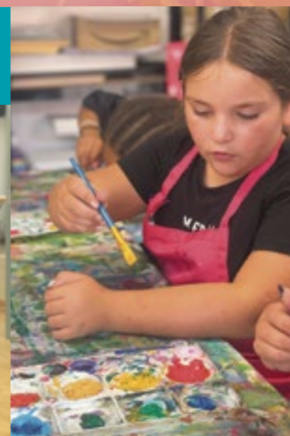
Getting creative in a painting session