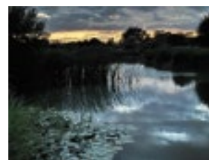
Redbridge Young Peoples category: Amber Madeley-Fox