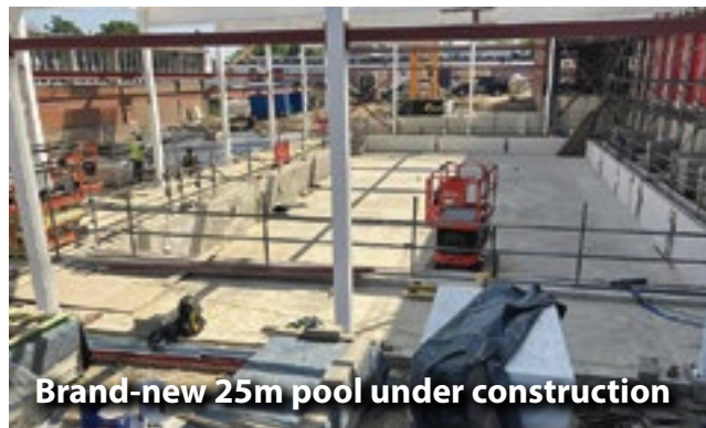
Brand-new 25m pool under construction

various fitness classes and squash and badminton courts.