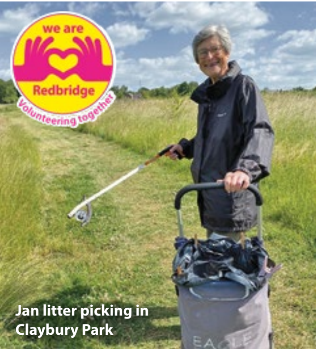
Jan litter picking in Claybury Park

also involved in nature conservation days led by park rangers, with other volunteers, doing all kinds of jobs from cutting back brambles, bushes and shrubs, sowing a wildflower meadow, to painting park gates.