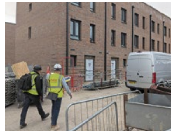
Loxford Lane housing development enters the final phase of completion having started work back in 2023