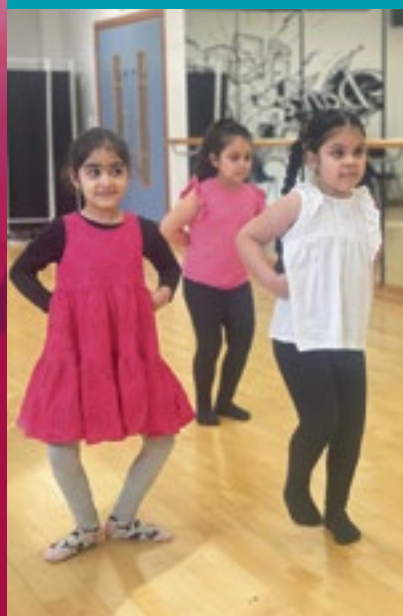
Children loved the Indian fusion dance class

Developing Redbridge's much-loved Megamix has been part of our work towards recognition from UNICEF UK as a child-friendly borough. We're putting children at the heart of our community and creating a place and activities that give them what they need to thrive.