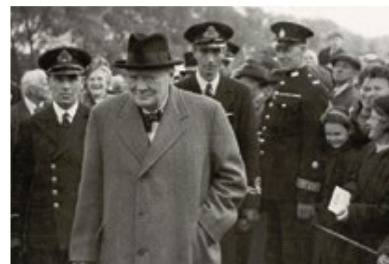
Churchill arrives at Wanstead & Woodford's victory celebrations, 1 June 1946

On 31 May to 3 June 1946, the borough of Wanstead and Woodford held their official victory celebrations on Woodford Green to mark one year since VE Day. They held a fair, which was attended by guest of honours wartime Prime Minister and local MP Winston Churchill.