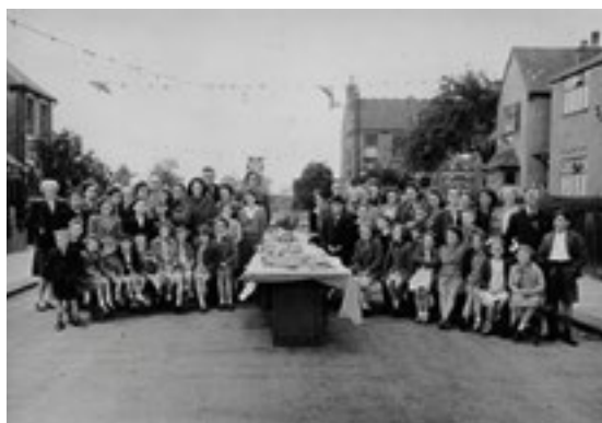
VE Day party, Birkbeck Road, Newbury Park

"When the tables were cleared and the games were over, the parents were out for all of the evening dancing in the street."