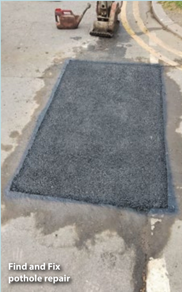
Find and Fix pothole repair

In the first round of Find and Fix, we repaired 1,723 potholes – in addition to our regular road maintenance work.