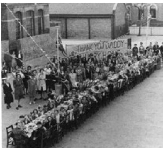
VE Day street party, Dudley Road, Ilford. Many men were still away fighting and those celebrating hold a sign: 'Thank You Daddy, Hurry Home'

Large tables lined the streets with banners and flags. There were games, singing, and dancing and lights were turned on at night to show that 'the blackout' was over.