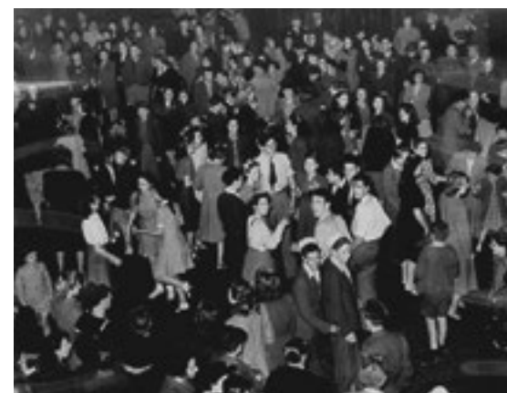
VJ Day 1945, somewhere in Ilford

Despite the celebrations, the war continued. On 15 August 1945 Japan surrendered, marking the end of the Second World War and Victory over Japan Day (VJ Day) was declared. The celebrations were more subdued than VE Day.