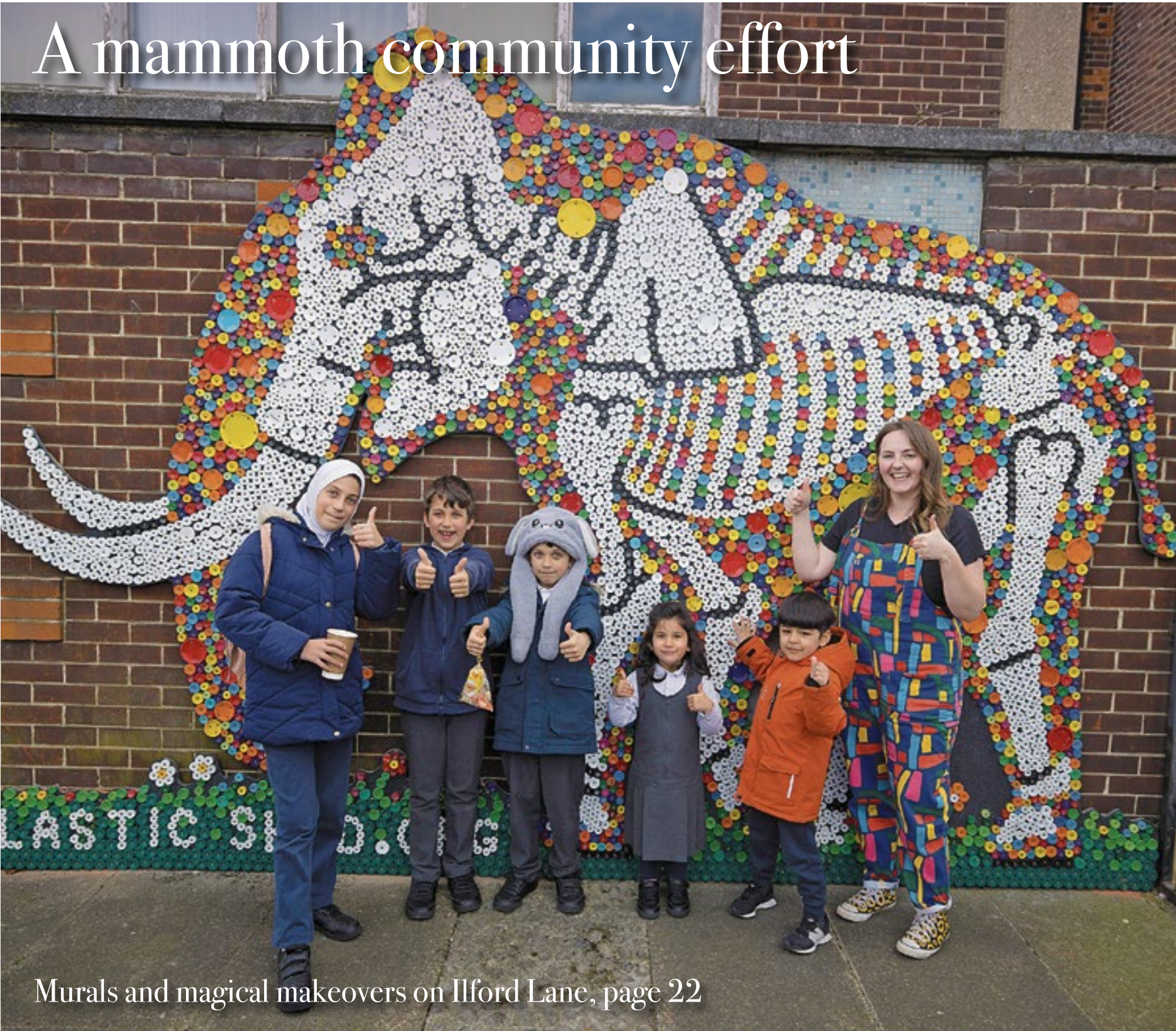
Murals and magical makeovers on Ilford Lane, page 22