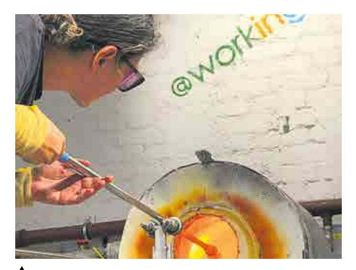
Get blown away by the new glass forge