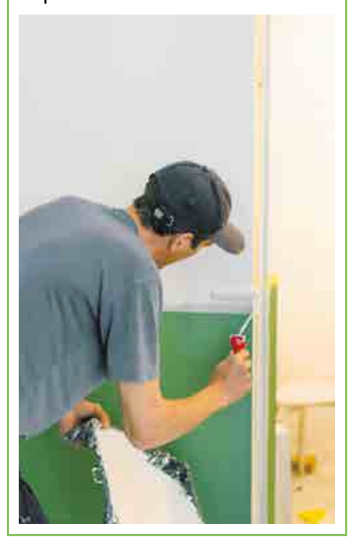
£11.2m on school maintenance and improvements