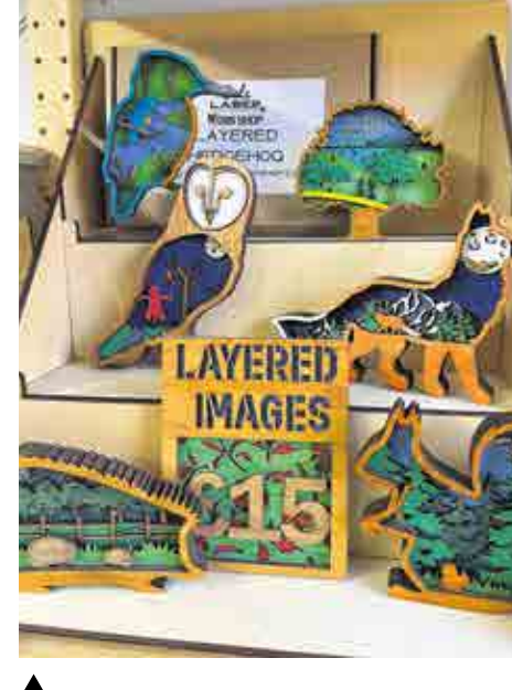
Find one-of-a-kind gifts at Del's Laser Workshop