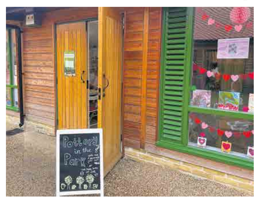
Pottery in the Park in Hainault Forest

Fancy some pottery in the park? Or woodworking in the woods? Come and visit our new artist workshops.