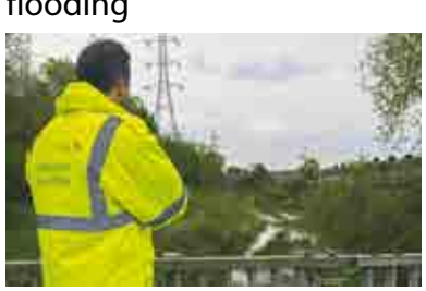
£1.8m on new schemes to prevent flooding