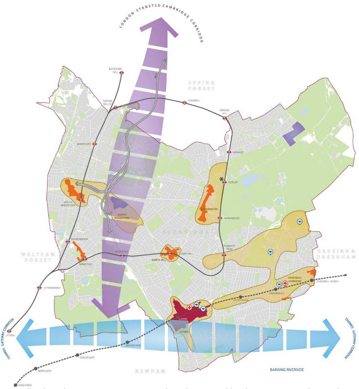
Figure 1: Local Plan Key Diagram

3.6 Redbridge's housing target is imposed on the Council by the Greater London Authority via the London Plan. It follows the national position set out in the National Planning Policy Framework. Whilst various policy changes (regional and national) vary the targets, Redbridge's housing target (for the 2017-2020 period) was to deliver 1,123 new homes per year. With the adoption of the new London Plan, the target is now 1,409 a year.