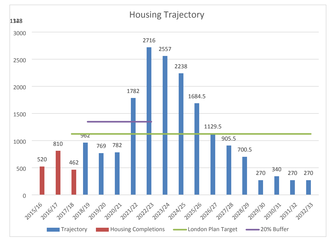
Figure 4.1 - Housing Trajectory Graph 2015 – 2033

4.2.22 Figure 4.1 shows the anticipated housing trajectory. The trajectory is based on the sites included in the 2013 London SHLAA but also includes additional sites identified through the development of the emerging Local Plan (2015 – 2030), and an allowance for "windfall sites" (redevelopment sites not identified within the Local Plan). The 15 year housing trajectory demonstrates that Redbridge will be able to meet and exceed its London Plan target of 1,123 homes per year from 2015 to 2030, a total of 16,845 homes over that period.